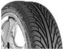
UTQG V-Rated 280 A A Others 280 AA A