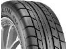
UTQG 220 AA